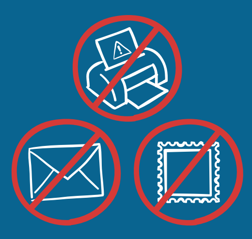
How much time and money could you save if you didn't have to print, address, and prepare your accounting documents for mailing?